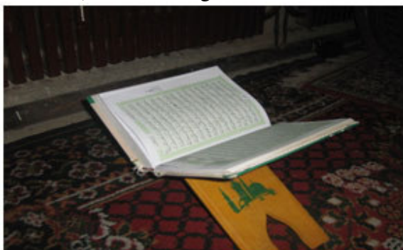
Holy book of Muslims "Koran"

Every religion of the world has been named either after its founder or after the community or nation in which it was born. For instance, Christianity takes its name from its prophet Jesus Christ; Buddhism from its founder, Gautama Buddha; Zoroastrianism from its founder Zoroaster; and Judaism, the religion of the Jews, from the name of the tribe Judah ( of the country of Judea ) where it originated.