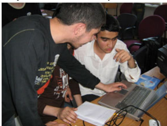
Students practice journalism in AzETA office, Baku